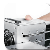
Easy-assembly internal drive cage for 4 x 3.5" HDDs