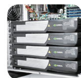
8-slot for 4 x GPU cards (RM41300G)