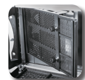
Easy-assembly front 120mm fan with filter