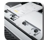
Anti-vibration drive cage design